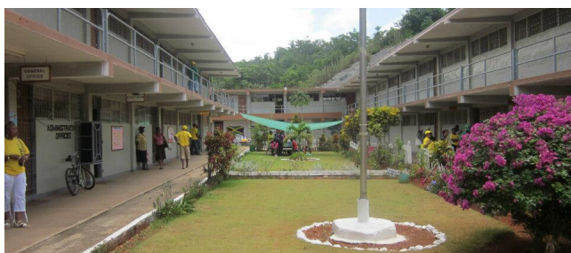
Beautifully Manicured Lawns of Aabuthnott Gallimore High School.