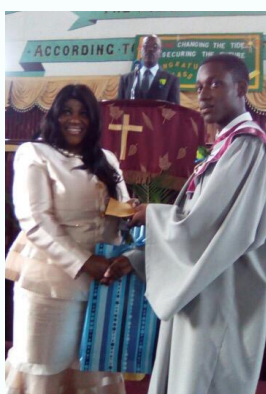
Top Male Student collecting his Award from the PSA.- 2017

As part of our ongoing effort to create a meaningful impact on graduating students, the Alumni have, for the past three years, awarded gifts to the top-performing male and female students for their overall academic achievements. Each top performing male and the female student received a laptop along with the cash incentive of JA. $5,000.00. For this past graduating batch, the top male and female students received the laptop. Cash incentive was awarded to a student for most improved in his academics.