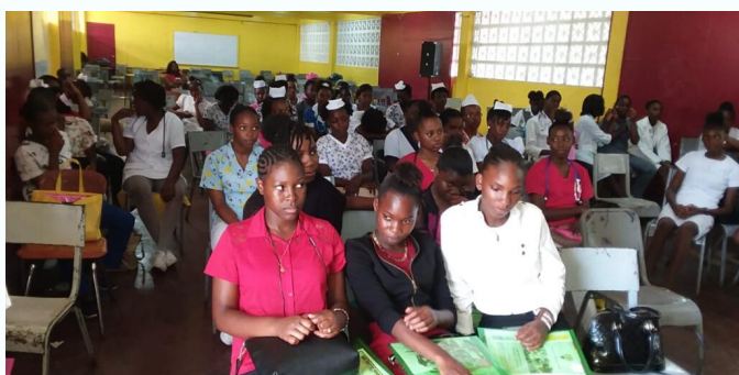
Students listening attentively to Presentation at Career's Day 2019

A very successful event since started two years ago, Career Day has seen past students visiting the school to speak to students on varying career paths. The alumni's main objective of this is to provide career networking where students can attain useful information and guidance when choosing a career path. We encourage all past students from different backgrounds - whether you are in the field of farming, teaching, building, hospitality, medical, business, entrepreneurship to participate in this event. You would be surprised to know the impact you might have on one student walking through the door of Aabuthnott Gallimore High!