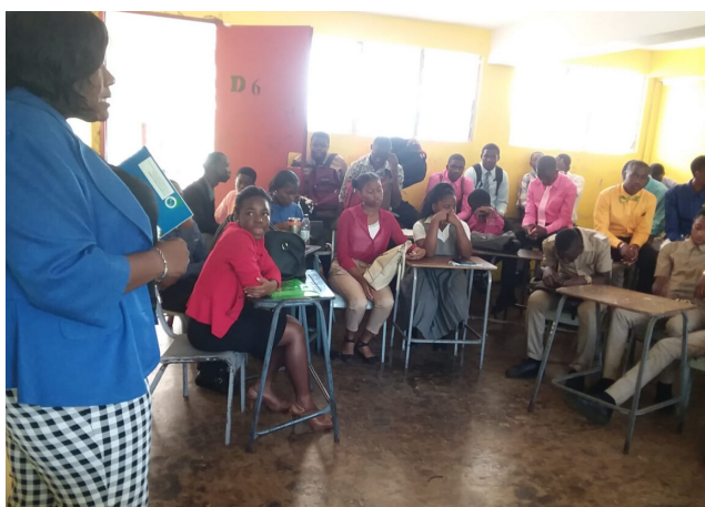
Students listening attentively to the Law and Justice Presentation at Career's Day 2019

We encourage past students to participate in this mentoring program whether to become a role model for these students, offer your time to teach and advise students in areas they need help in or, provide financial support. Doing so will create a long-lasting relationship with these students who will, in turn, feel compelled to return said favor to other students.