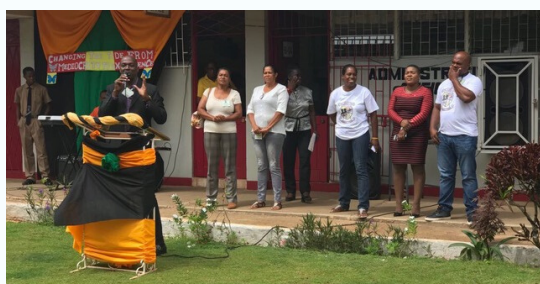
Members of the Jamaica Chapter of the Aabuthnott Gallimore Alumni sharing with the AGHS Family at the handing over of Cheque to Home Economics Department in 2017

To provide support for enhancing the quality of education for the success of students at Aabuthnott Gallimore High School. We will work in collaboration with the school to encourage alumni participation in its programs, activities and development efforts.